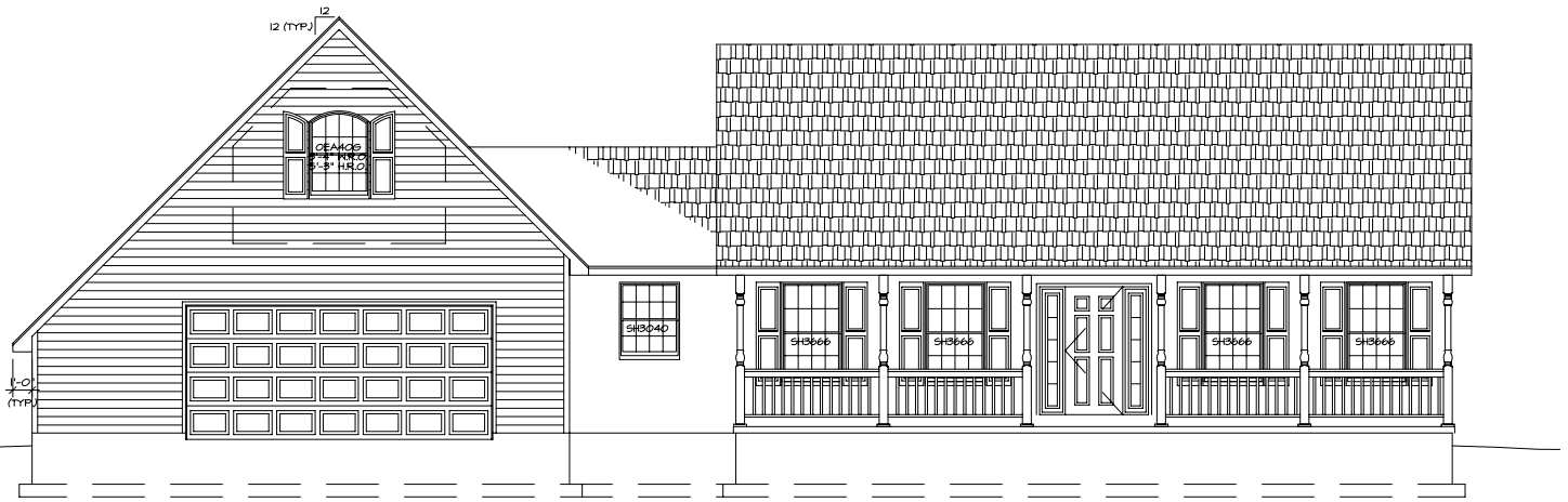
SOUTH ELEVATION SCALE: 1/4"=1'-0"